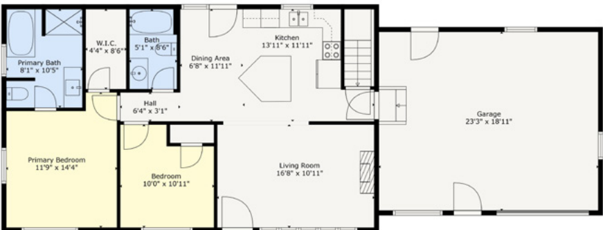
Standard Floor Plan